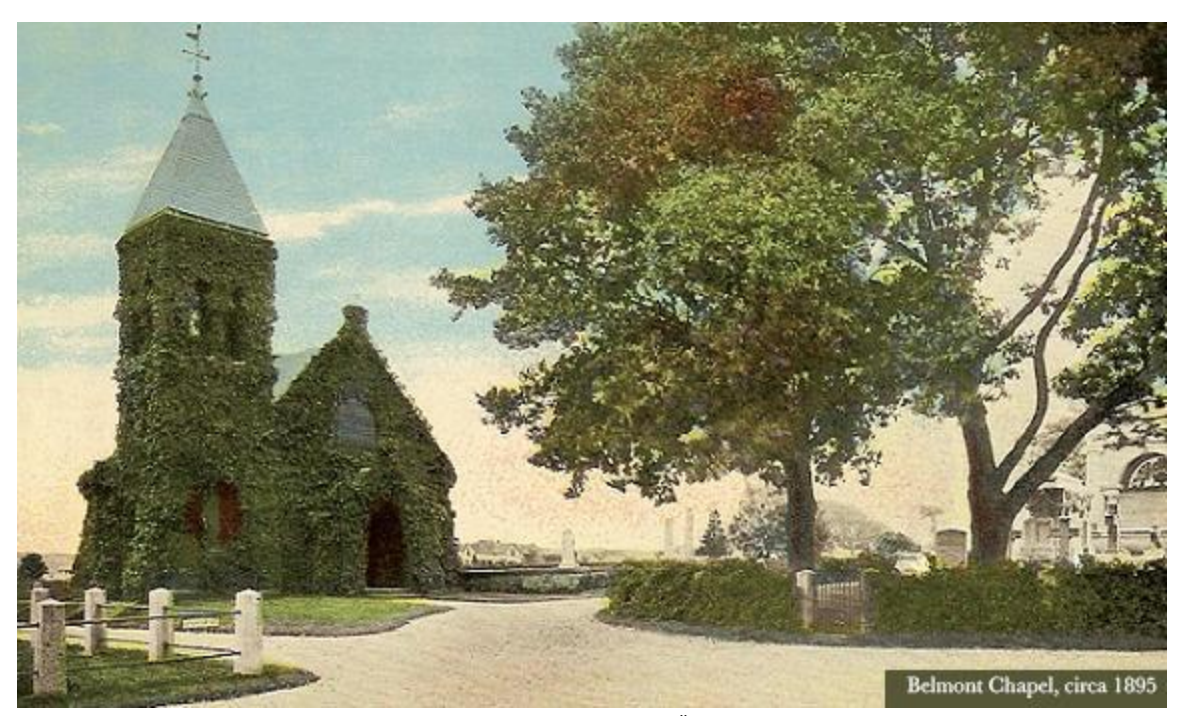
Chapel description from an August 20, 1887 news article<sup>xii</sup>:

The Belmont Chapel, Interesting Description of the Beautiful Altar and Elegant Furnishings